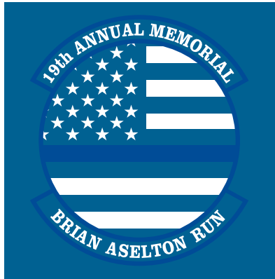
FRONT VIEW-LEFT CHEST